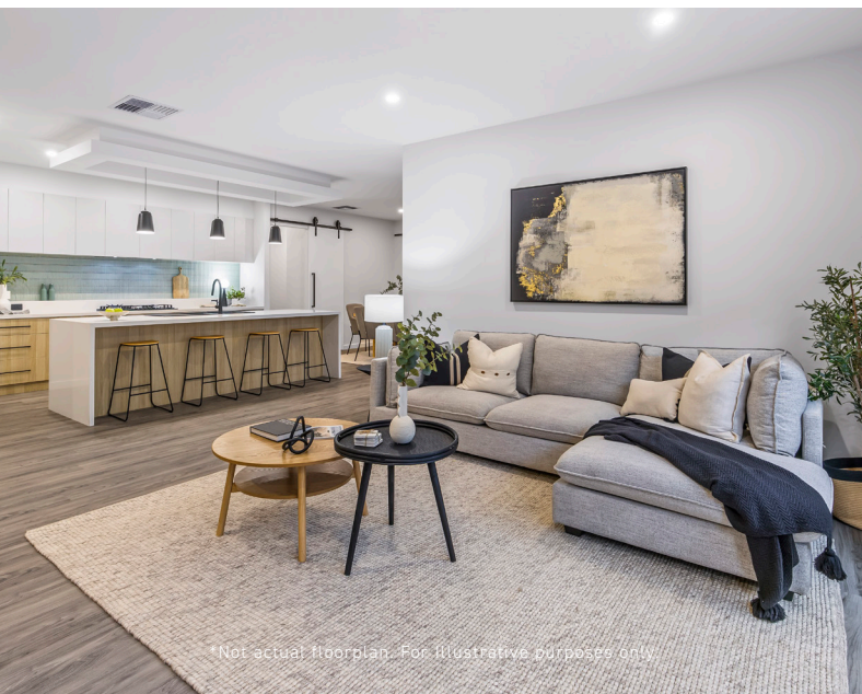
*Not actual floorplan. For illustrative purposes only.

Only a 10% deposit is required upfront, and the remaining balance is paid on completion of the home.