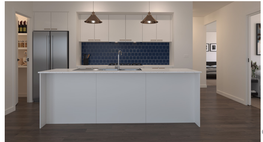
Hamptons Scheme Kitchen: Base & OHC Cabinetry: Formica Warm White Velour, Benchtop: SA White Burst* Handles: SO-3440-160-BN Provincial Brushed Nickel, 128mm to bathrooms. Tiles: SPAWP1043 brick lay