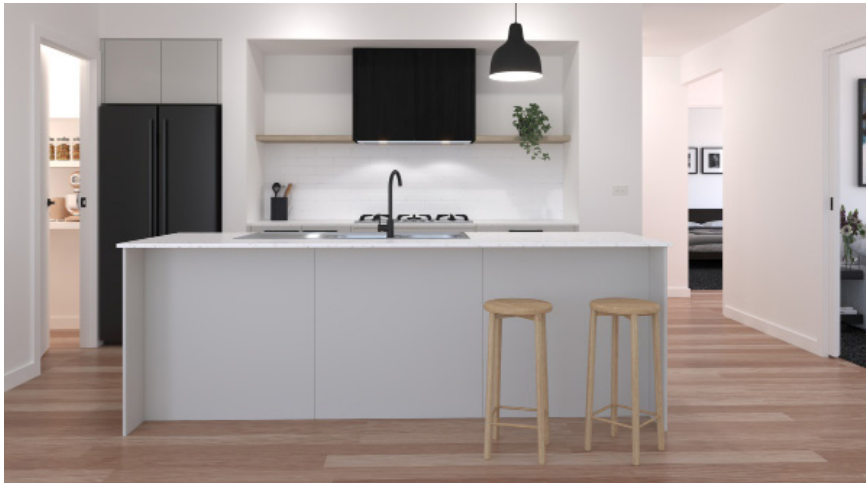
Urban Scheme Kitchen: Base Cabinetry: Formica Seal Grey RH: Polytec Black WM, Floating Shelf: PT Natural Oak Benchtop: SA White Burst* Handles: SO-A-160-BN or BLK Tiles: White Whoosh Matt horizontal brick lay