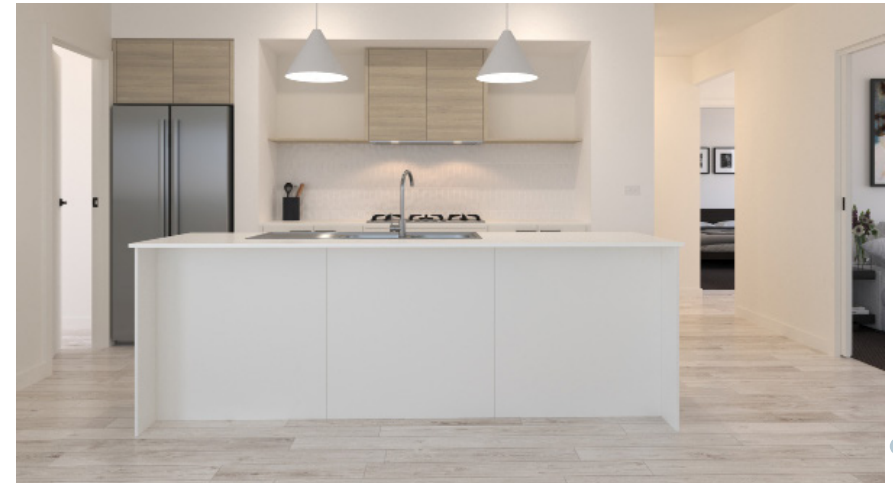
Tonal Scheme Kitchen: Base Cabinetry: Polytec Avion Grey Matt, OHC & Shelf: Polytec Ligurian Walnut WM, Benchtop: SA White Burst* Handles: Jay Artia White 111.33100.001 Tiles: NT19-2200FL vertical brick lay Single bank of drawers to one side of oven.