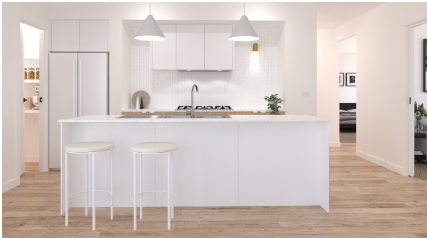
Scandinavian Scheme Kitchen: Base Cabinetry: Formica Snowdrift Velour, OHC: Formica Idyllic Velour, Benchtop: SA White Burst* Handles: Jay Artia Brushed Nickel 111.33100.412 Tiles: 18026 vertical brick lay